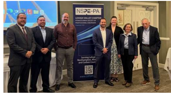
Installation of the 2026-2027 LV PSPE Officers.