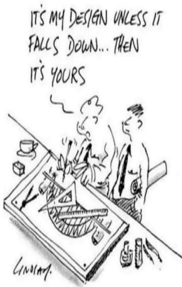
( www.ppehq.com/blog/engineering-jokes )