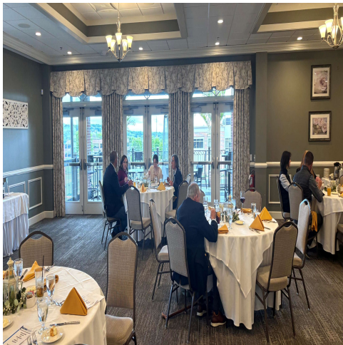
Scholarship Awards and Installation of Officers LV PSPE May 2026 Dinner Meeting.