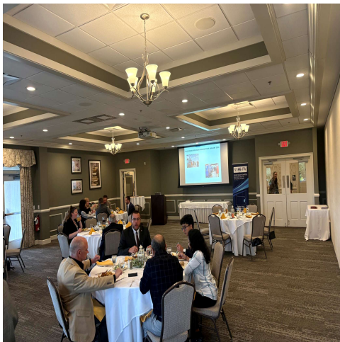
Scholarship Awards and Installation of Officers LV PSPE May 2026 Dinner Meeting.