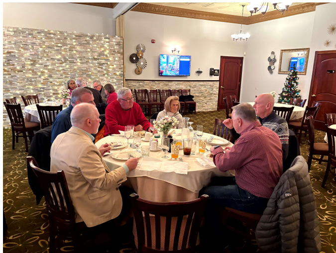
Members/Families of LVPSPE – Holiday Dinner at Kingfish American Bistro & Wine Bar.

Members and guests of our Chapter celebrated the Holiday Season on December 11 th , at Kingfish American Bistro & Wine Bar, located at 3833 Freemansburg Avenue, Bethlehem, PA. The decorations, the staff, and the general atmosphere of Kingfish American Bistro & Wine Bar during the Holiday Season contributed to the general good spirit of the occasion.