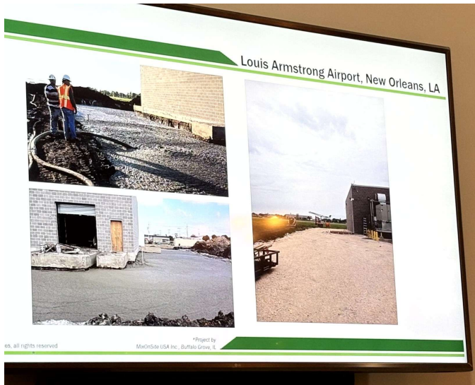
Application of LDCC.

On behalf of the LVPSPE board of directors, we want to wish you and your families a wonderful Holiday Season and a healthy, successful New Year.