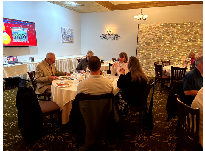
Members/Families of LVPSPE – Holiday Dinner at Kingfish American Bistro & Wine Bar.