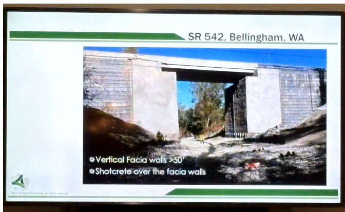
Application of LDCC.